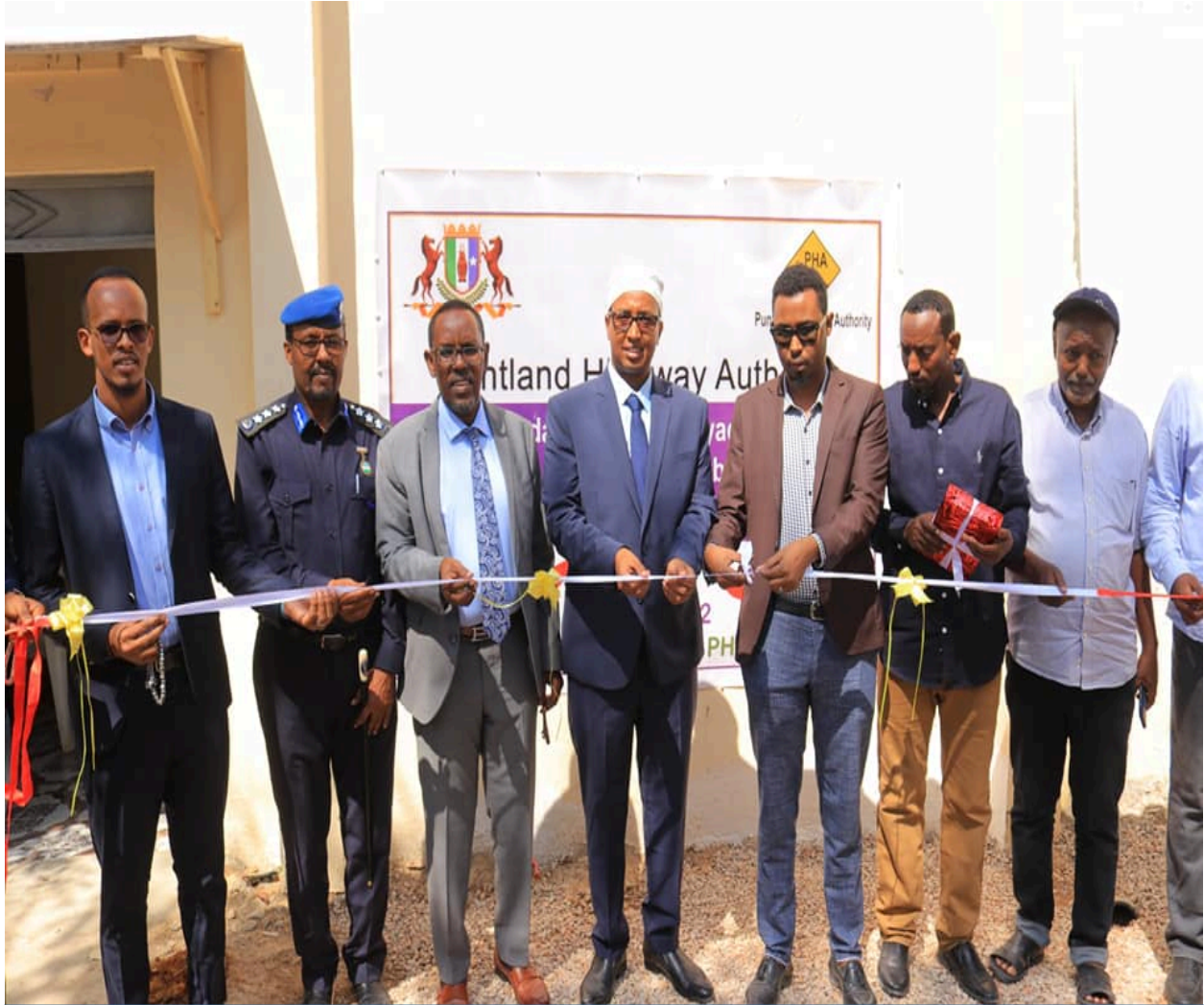
XARIG JARKA DAYACTIRKA XAFIISKA HAY'ADDA WADDOOYINKA DPL